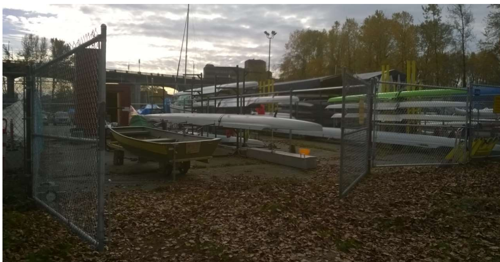
November 22, 2015

As at June 8 th 2017, we have 6 singles, 2 doubles, a quad, 2 coxed quad/four and two eights. We also have access to a private member's ocean going double. There is one private single, and another planned. This includes 2 singles from the RCA Western Recreational Fleet: and keeps out fleet at about 40 seats, compared to 41 (not all functional in 2016) and up from 10 in 2015.