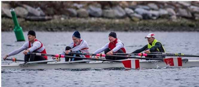
The City of Vancouver Rowing Champion title was again bestowed upon a quad from the Vancouver Rowing Club.

Without the efforts of many of our volunteers we would have been really stuck. Vancouver College, the Kitsilano Yacht Club and the Jericho Sailing Centre's people and safety boats conspired again help keep the regatta moving safely along. The Canadian Coast Guard helped shovel the docks which helped us launch and recover boats safely.